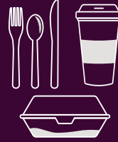
Food containers & cups