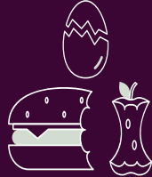
Food & liquid